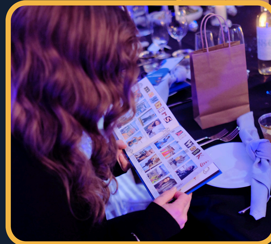
← WOS Yearbook