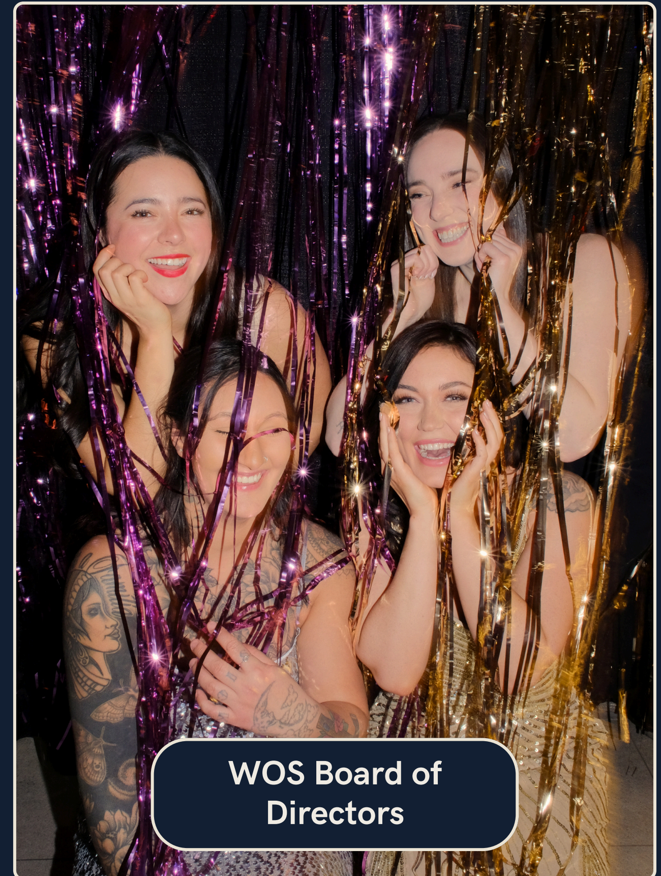
WOS Board of Directors

Proceeds from Let It WOS will support Women On Site's programs, empowering women across Canada. Join us for this special occasion to celebrate our collective progress and look forward to an inspiring year ahead!